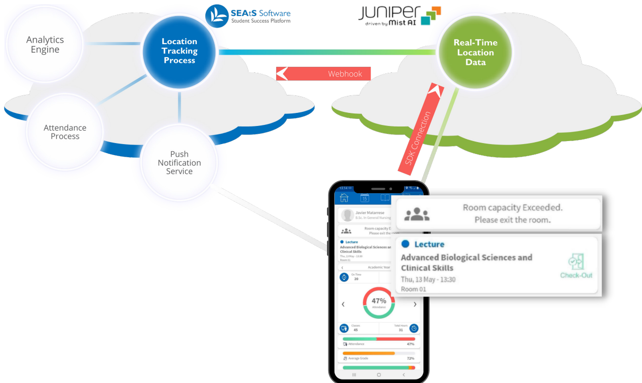
Figure 2: The process behind identifying over-capacity rooms.