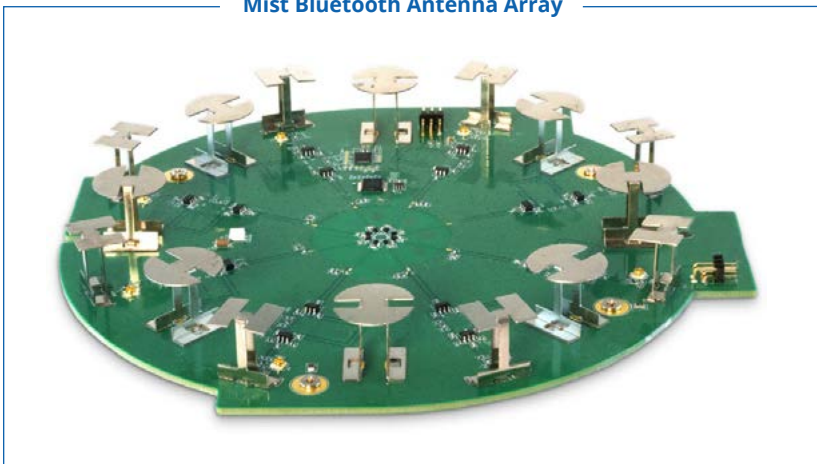
Mist Bluetooth Antenna Array